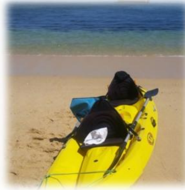
Kayaking from nearby Lagos