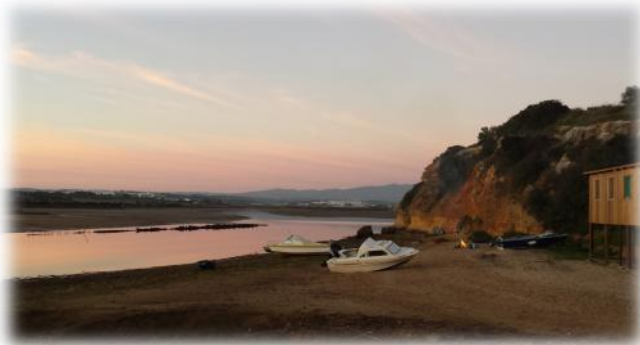
Fisherman's hut on the estuary