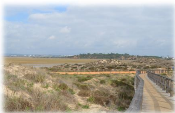
Wild flowers on the estuary walk